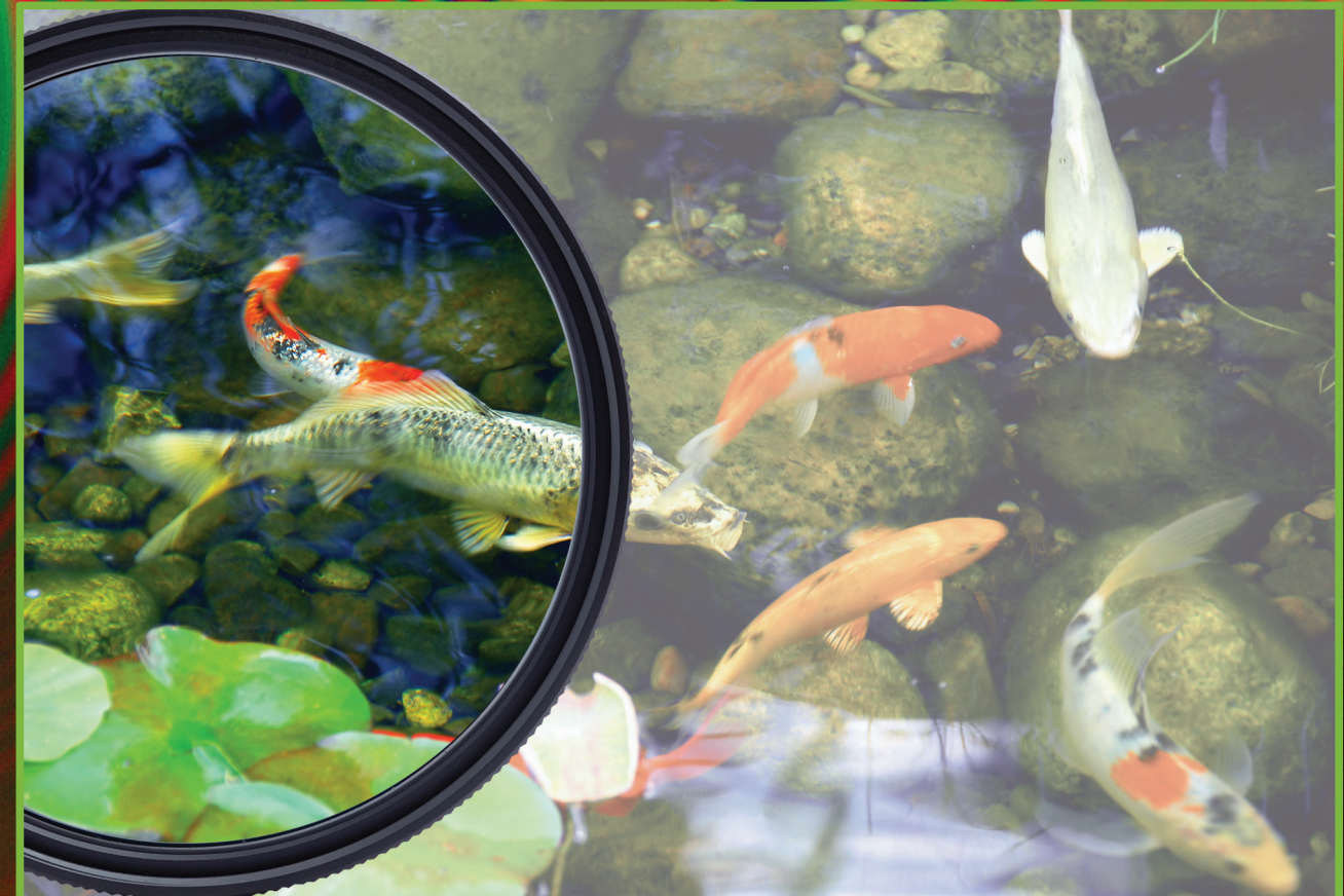
A polarizing camera filter removes the light waves that are oriented in a direction that causes surface glare.

On this soap bubble, interference causes light waves to combine and reinforce certain colors.